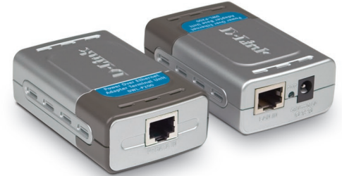
DWL-P200 Power over Ethernet Adapter